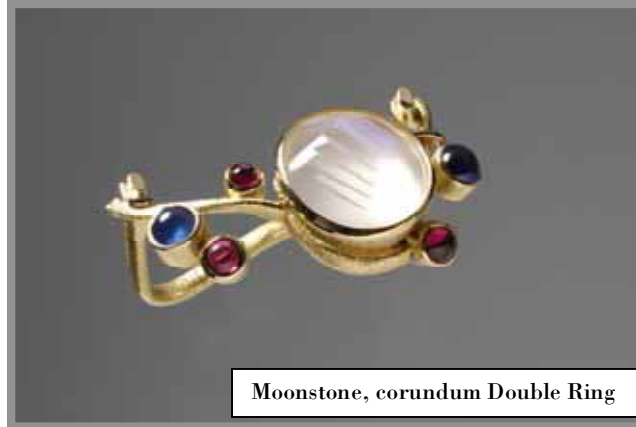
Moonstone, corundum Double Ring